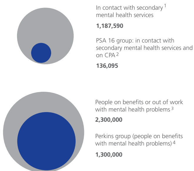
FIGURE 1: RELATIVE SIZES OF WORK, RECOVERY AND INCLUSION AND THE PERKINS REVIEW CLIENT GROUPS