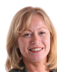
Kevin Brennan Minister for Further Education, Skills, Apprenticeships and Consumer Affairs